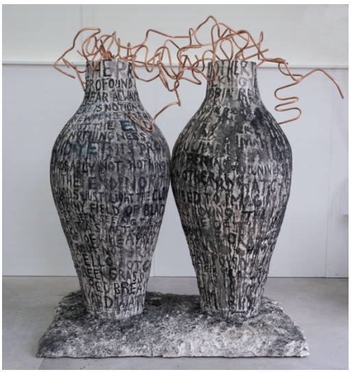
Jim Dine, Cry, the poems, 2024, acrylic on painted polymer resin with copper tubes, 220 x 200 x 100 cm / 78 x 78 x 39 in