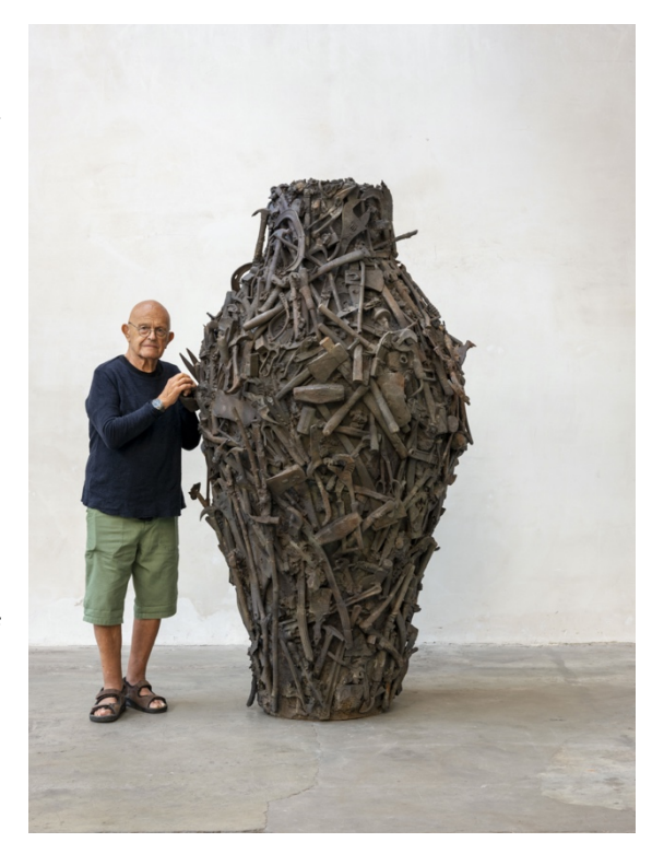
Jim Dine, Flowers , 2022, patinated bronze, 215 x 130 cm / 84 x 51 in

Jim Dine - Dog on the Forge presents 32 new works from the artist. Paintings, drawings, bronze and wood sculptures, as well as an impressive outdoor installation of large-scale bronze sculptures. The exhibition debuts monumental and site-specific works conceived specifically for the Biennale Arte 2024. Neverbefore-exhibited paintings and sculptures will be arranged in dialogue with each other and with artworks spanning from the '80s through today. Curator Gerhard Steidl drew inspiration from Dine's relentless odysseys between the United States and Europe, as well as his lifetime dedication to the concept of visual, cultural, and linguistic hybridization. "My whole life, I've been in motion. I find it difficult to sit still. It's a hyperactive quality, I would say. I've always enjoyed going from studio to studio, country to country. For me, traveling is like using red. It's another thing to make the picture."