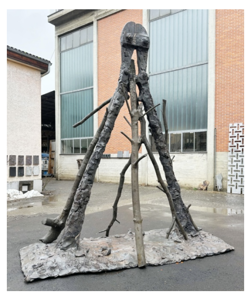
Jim Dine, Bolt-Cutters , 2024, bronze, 400 × 290 × 64 cm / 157 x 114 x 25 in

Pre-opening: Wednesday, 17 April, Thursday, 18 April, Friday, 19 April from 10:00 AM to 6:00 PM